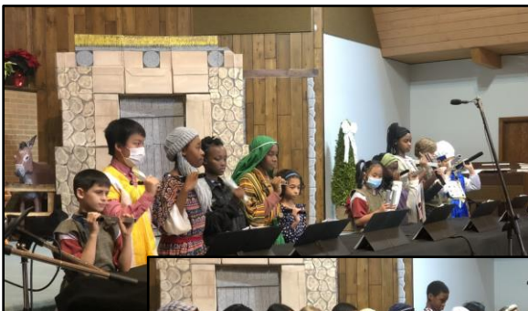
Students play handbells and chimes for special music.

Parkview Sabbath was a great success. Thank you to our teachers for working so diligently with the students to put on a great program. Thank you as well to our parents who worked with their child(ren) from home and supported our school with their presence. If you were unable to attend or would like to enjoy the service again, you can visit the Westvale SDA Church's YouTube channel or Facebook page.