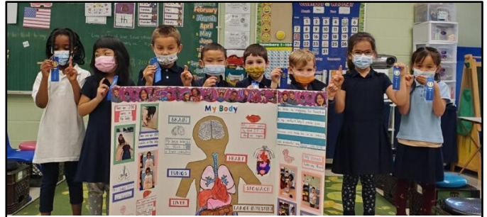
Kindergarten students earned first place ribbons for their Education Fair project about the human body.

Students in grades K-8 enjoyed their visit to Union Springs Academy for Education Fair. Many came home with colorful ribbons to celebrate their hard work on this year's projects.